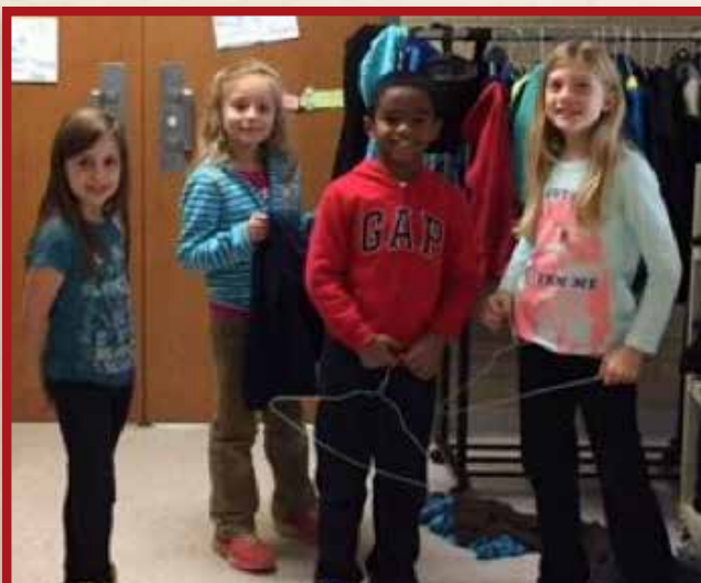
Lost & Found Team prepping for Parent Teacher Conference Night

The VCSF is excited to help Sunset Lake Elementary School student leaders make great things happen!