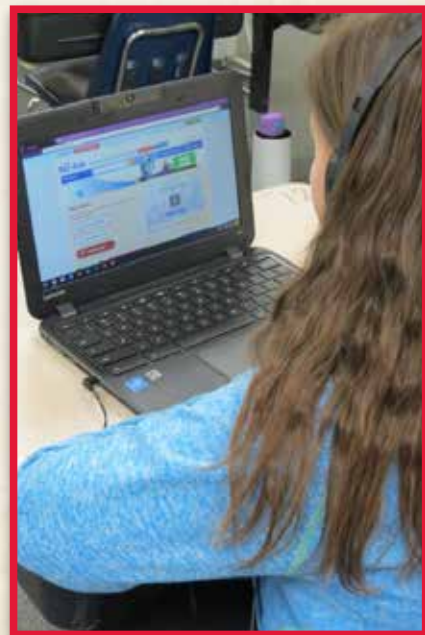
Maddie Eyster using Raz-Kids online reading program

A Microsoft Surface Pro was purchased to support the implementation of VCS' Instructional Coaching model and the mission of, "Excellent instruction, every day for every student."