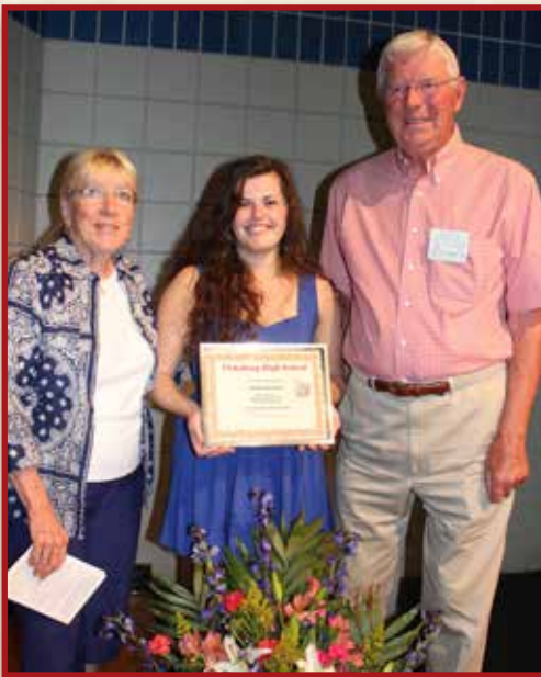
2016 Louise Reed Memorial Scholarship