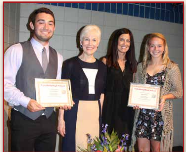
David T. Reisterer Memorial Scholarship