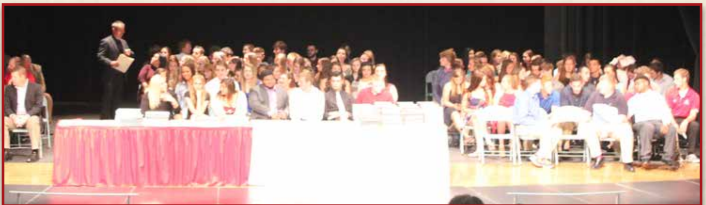
2016 VHS Honor Students

For complete scholarship and donor information, please visit www.vicksburgcommunityschools.org/foundation/scholarships.shtml