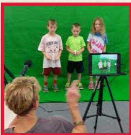
Students creating videos using the new Green Screen technology

The Vicksburg DECA Chapter attended the Michigan DECA Career Development Conference at Eastern Michigan University. This conference allowed the students to network with other schools and businesses to form partnerships, and learn how other schools operate their DECA Chapters.