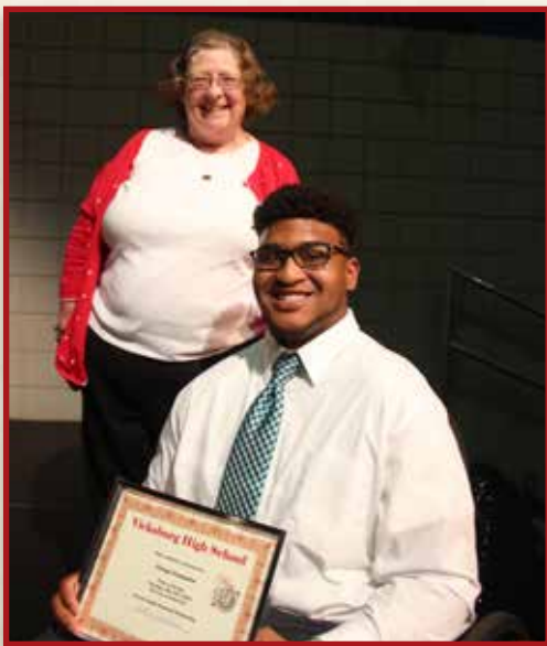
2016 Jeremy Smith Memorial Scholarship