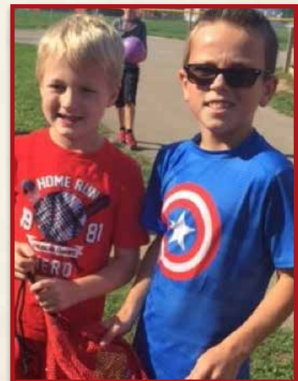
Students excited about new equipment from the Beautification Team’s “Playground Shower”

Through the theme: Together, We are Building Leaders , teachers and staff help all students see themselves as leaders. Each month, the building focuses on a specific habit, as students learn about, practice, and live it.