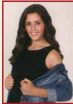
Katie Reed Gordon and Dorothy Daniels Memorial Scholarship $2,000