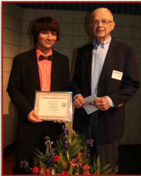
2016 Appell Family Scholarship