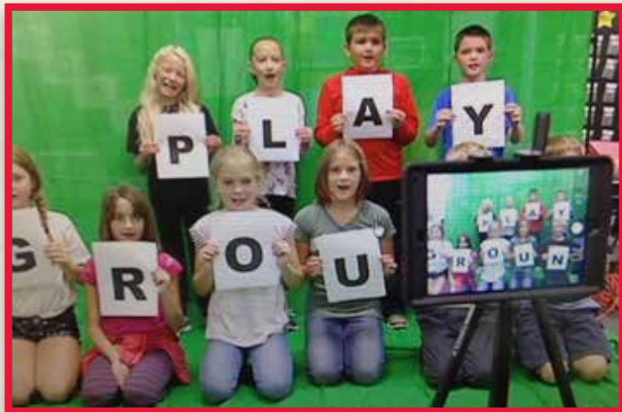
Tobey students supporting the new all-inclusive playground